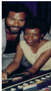
PMT & Raining Deer at Thomas' Spaceship Records Studios, North Miami, Florida